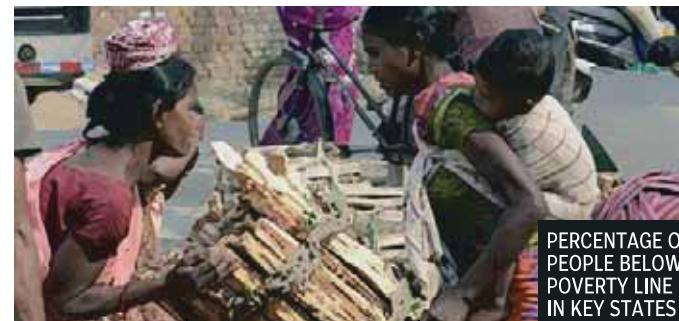
PERCENTAGE OF PEOPLE BELOW POVERTY LINE IN KEY STATES